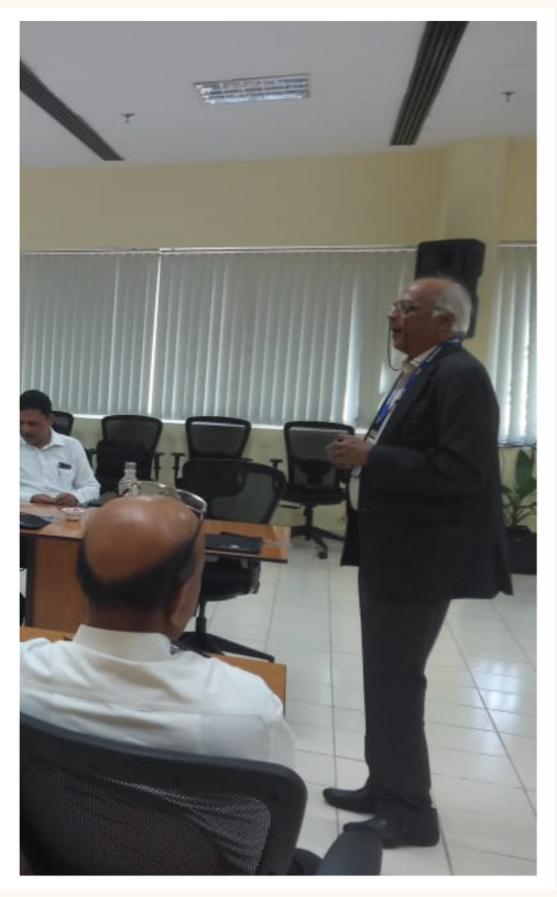
Capital Goods Skill council organised validation workshop in association with Indian Machine and Tools Manufacturers Association (IMTMA), at Bengaluru for validation of Industry 4.0 qualifications.